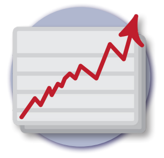
PROMOTING ECONOMIC GROWTH