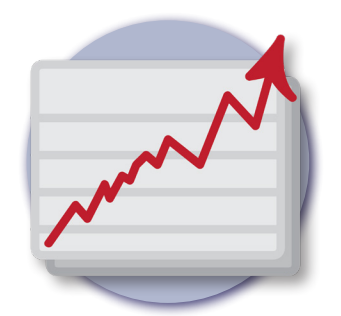
PROMOTING ECONOMIC GROWTH