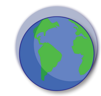
PROTECTING THE ENVIRONMENT

There have already been significant improvements but we still have a long way to go. There is no shortage of solutions. Explore what's working and what isn't, and use your unique perspective, talents and ideas to help solve the worlds greatest challenge.