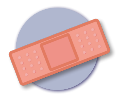
IMPROVING HUMAN HEALTH

IT'S COMPLICATED, BUT WE'RE MAKING POVERTY BY FOCUSING ON: